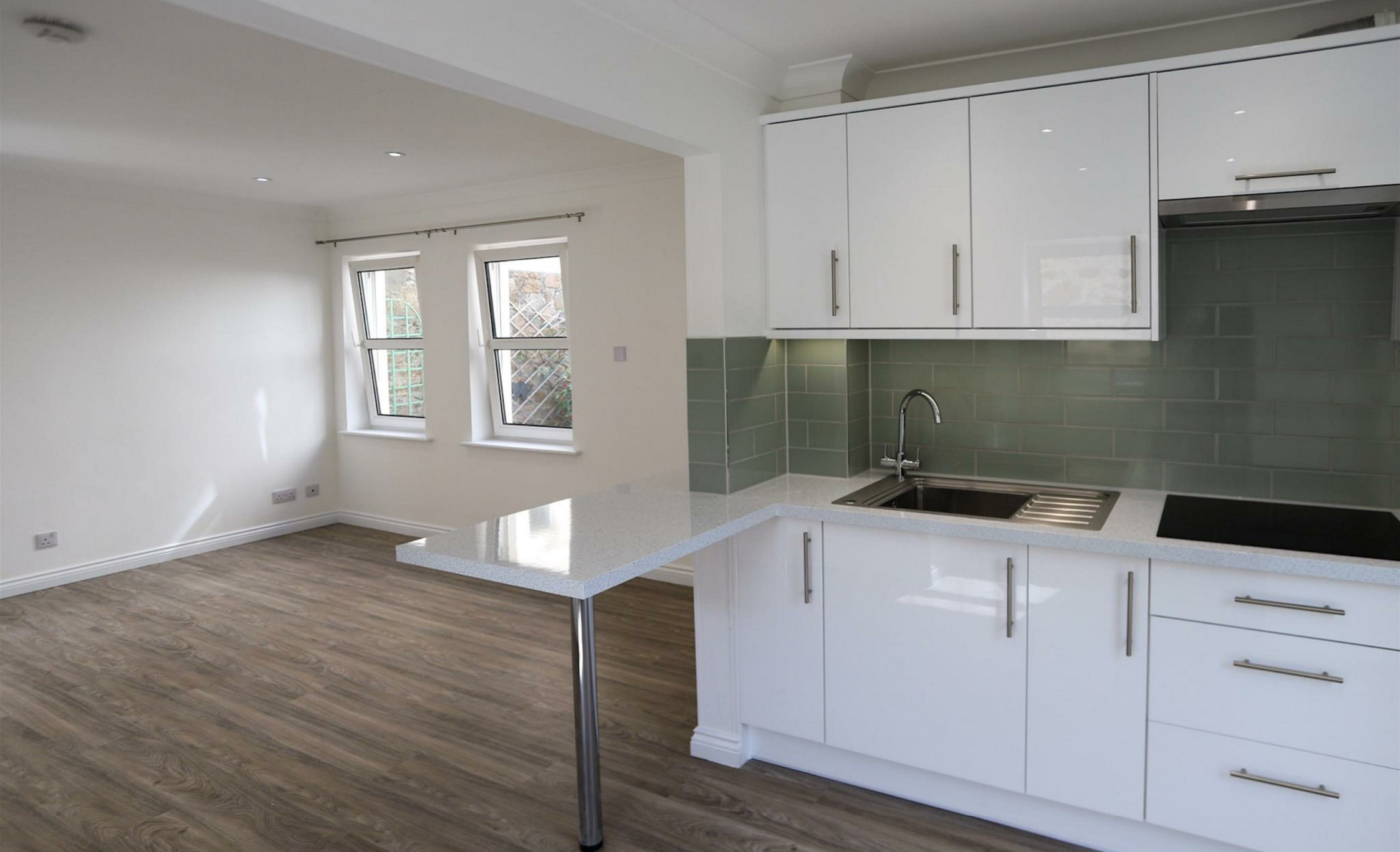
The Cottage 59-60 David Place, St Helier, Jersey, JE2 4YN £1,900